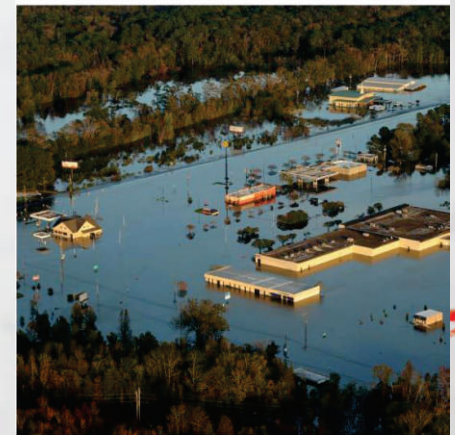
NORTH CAROLINA FLOODING