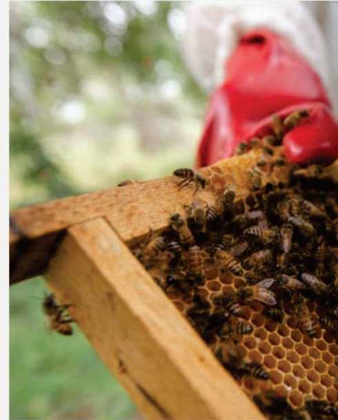
A Beehive in Kenya $60.00