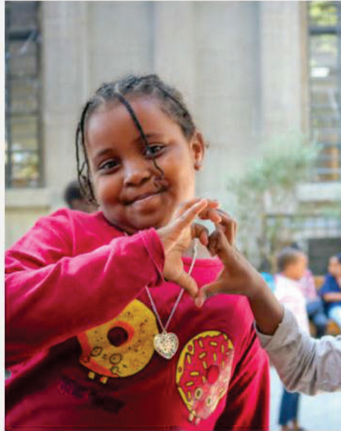
Rides to School for a Refugee Child in Egypt $10.00