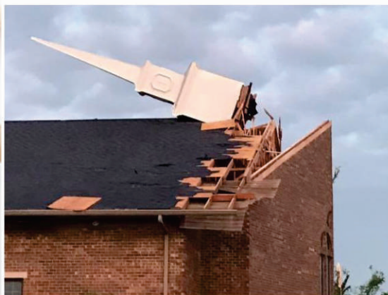
SPRING TORNADOES AND FLOODING