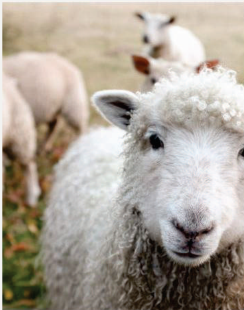
A Sheep in Kenya

After seven decades moving towards this goal, CWS has the faith and experience to know it's possible. Working around the world, we've seen gardens flourishing in barren land. Migrants and refugees finding home even after every door has been closed. Houses standing strong against nature's worst disasters. That's the power of your compassion at work when it links to human resilience.