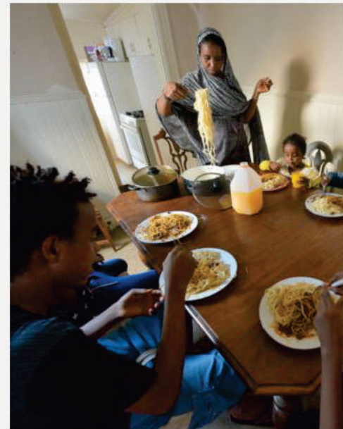
A "Welcome Home" Meal for a Refugee Family in the United States