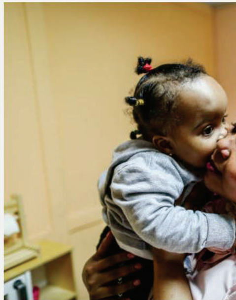
Bundle of Joy for a Baby in Egypt