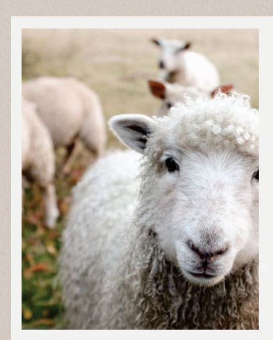
A Sheep in Kenya $60.00

After seven decades moving towards this goal, CWS has the faith and experience to know it's possible. Working around the world, we've seen gardens flourishing in barren land. Migrants and refugees finding home even after every door has been closed. Houses standing strong against nature's worst disasters. That's the power of your compassion at work when it links to human resilience.