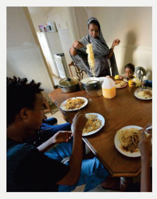
A "Welcome Home" Meal for a Refugee Family in the United States $75.00