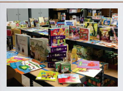
$20 ~ Purchases 10 to 20 books for students. Books are distributed four times a year.