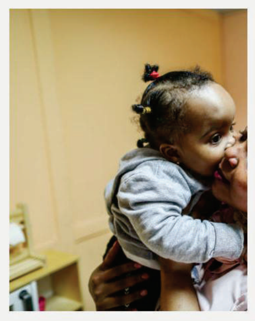
Bundle of Joy for a Baby in Egypt $65.00