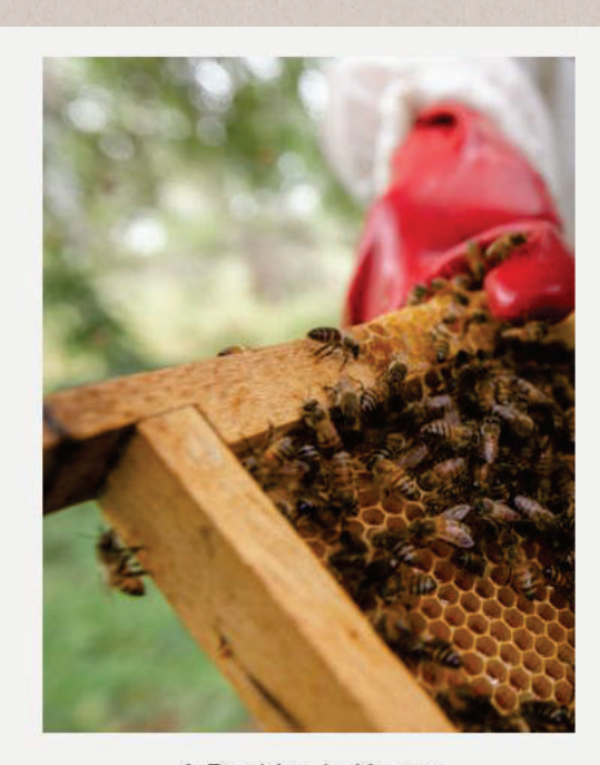
A Beehive in Kenya $60.00